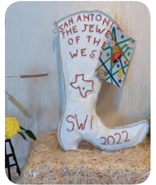
LAS VEGAS "San Antonio, The Jewel of the West"