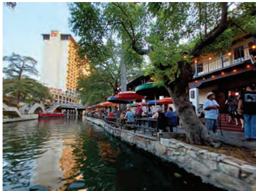
River Walk Cruise