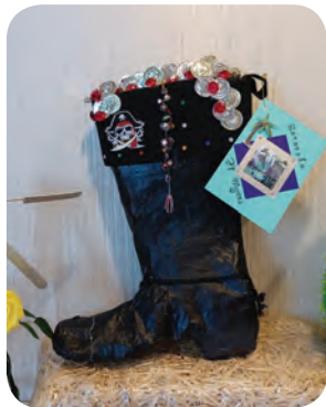
SARASOTA-FT MYERS "Shake Your Booty!!"