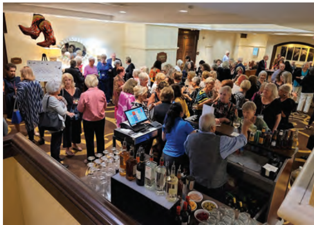
Cocktails first...then dinner party!