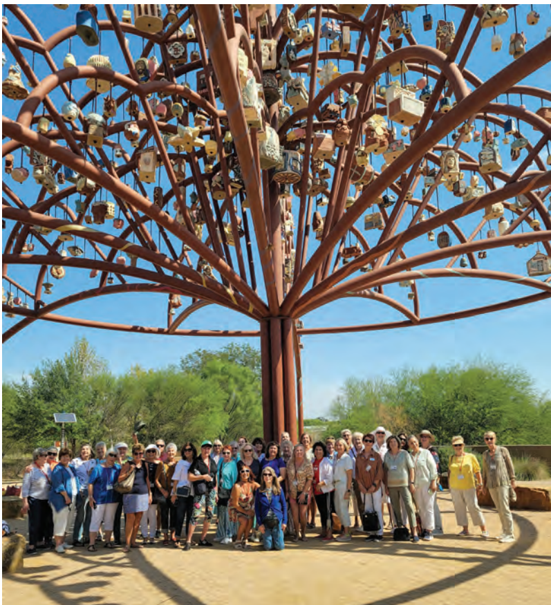
TREE OF LIFE with bus #1 passengers