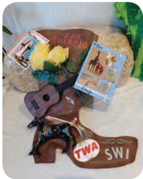
SAN DIEGO "Yellow Rose of Texas"