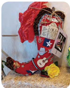
ST LOUIS "Boot Scootin' Down the Riverwalk"