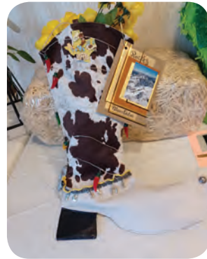
ROCKY MOUNTAIN "Boot Scooting Boogie Hall"