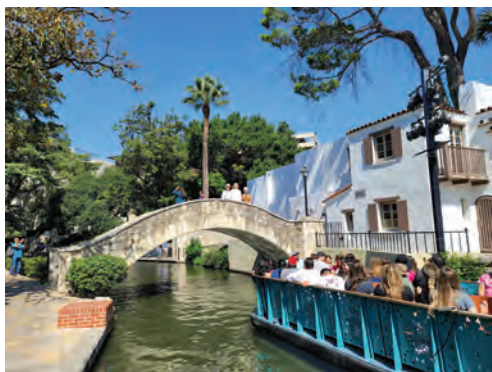
River Walk Cruise