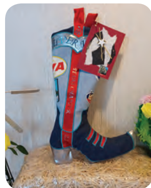
TEXAS "San Antonio SILVER Stepper"