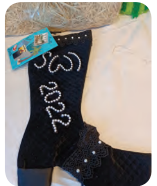
SE FLORIDA "Two Steppin to Texas"