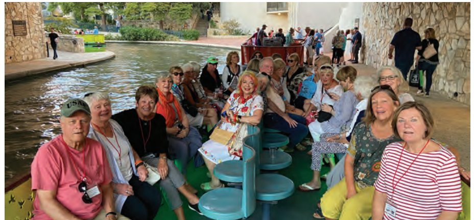
San Antonio River Walk Boat Tour