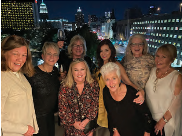
SAT River Walk View