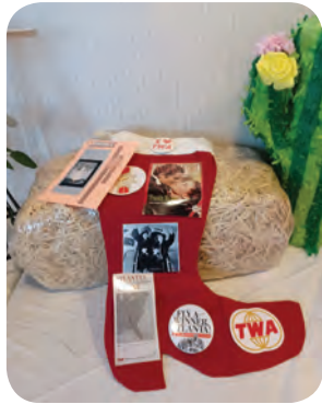
GEORGIA "Frankly, I Don't Give a Boot!"