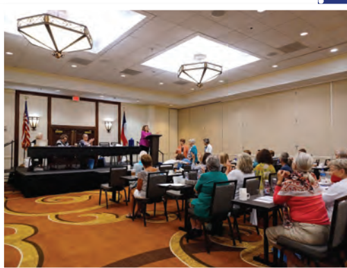
SILVER WINGS BUSINESS MEETING in San Antonio

"Strato Lizzie" was the mascot for Transcontinental Western Airline and was awarded by Cat Realist Society at the World's Fair Cat Show in 1940. Her home was the cockpit of a TWA Boeing Stratoliner. Ground crews took care of her necessities, while pilots logged her in on each flight. ■