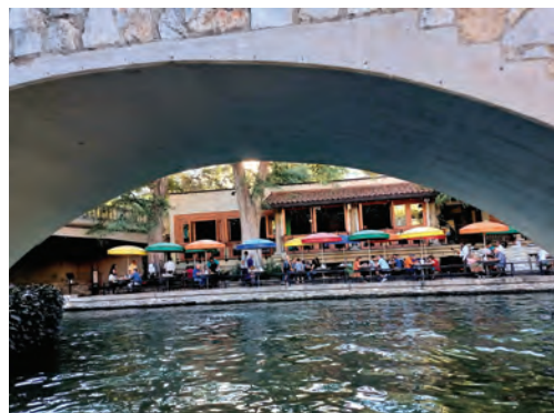
River Walk Cruise