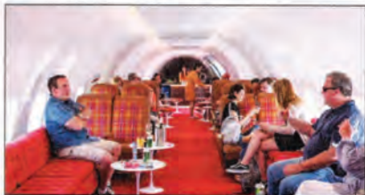
The prop-plane cocktail lounge at JFK

"A respectable airport restaurant is like a port in a storm," said Gabe Hiatt in The Washington Post . When you've braved security, crowds, and cancellations, you deserve a treat, and "even in the corporate wasteland of the airport, there's quality to be had." We surveyed critics and travel writers for their favorite sanctuaries at the country's busiest airports and came up with a great tip or two for each hub.