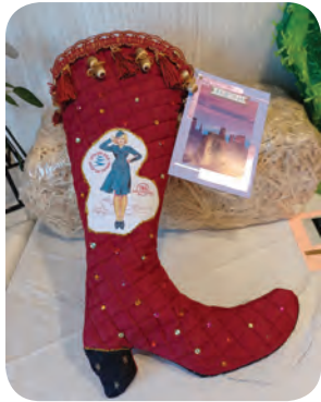
ARIZONA "Our Salute to TWA Memories"