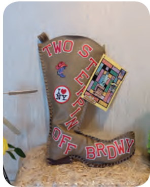
NEW YORK "Two Steppin Off Broadway"