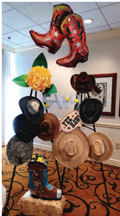
Photo op hats in the Crew Lounge