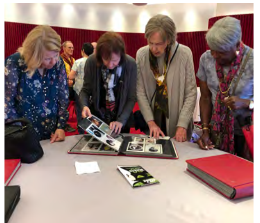
Enjoying Julia Falk's TWA Flt Attendants photo albums