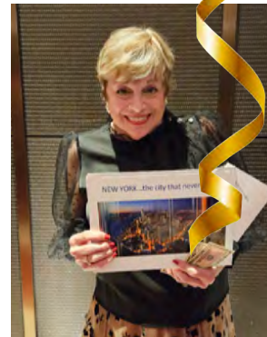
SOUTH EAST FLORIDA Faith Grill